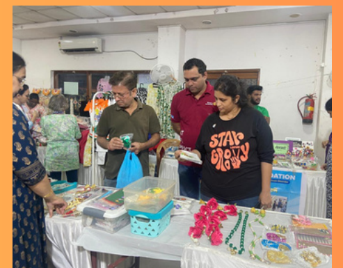
Pankh-Exhibition of articles by specially abled kids