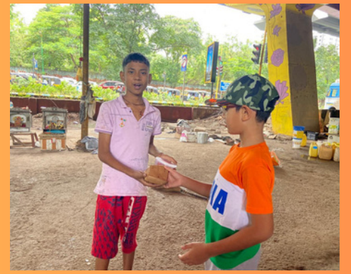
Snacks and sweets distribution to street kids