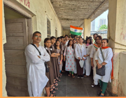
Geometry box distribution to 57 students of M. G. School