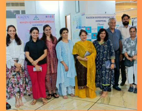
CPR Awareness at Kaizan superspeciality hospital